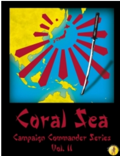
Coral Sea 48.00 €

“Coral Sea” is a new volume in the Campaign Commander series and simulates the campaign in the South Seas of the Pacific between the spring of 1942 and the spring of 1943. The Japanese expansion reaches its limit in the archipelago of the Solomon Islands [Product Details...]